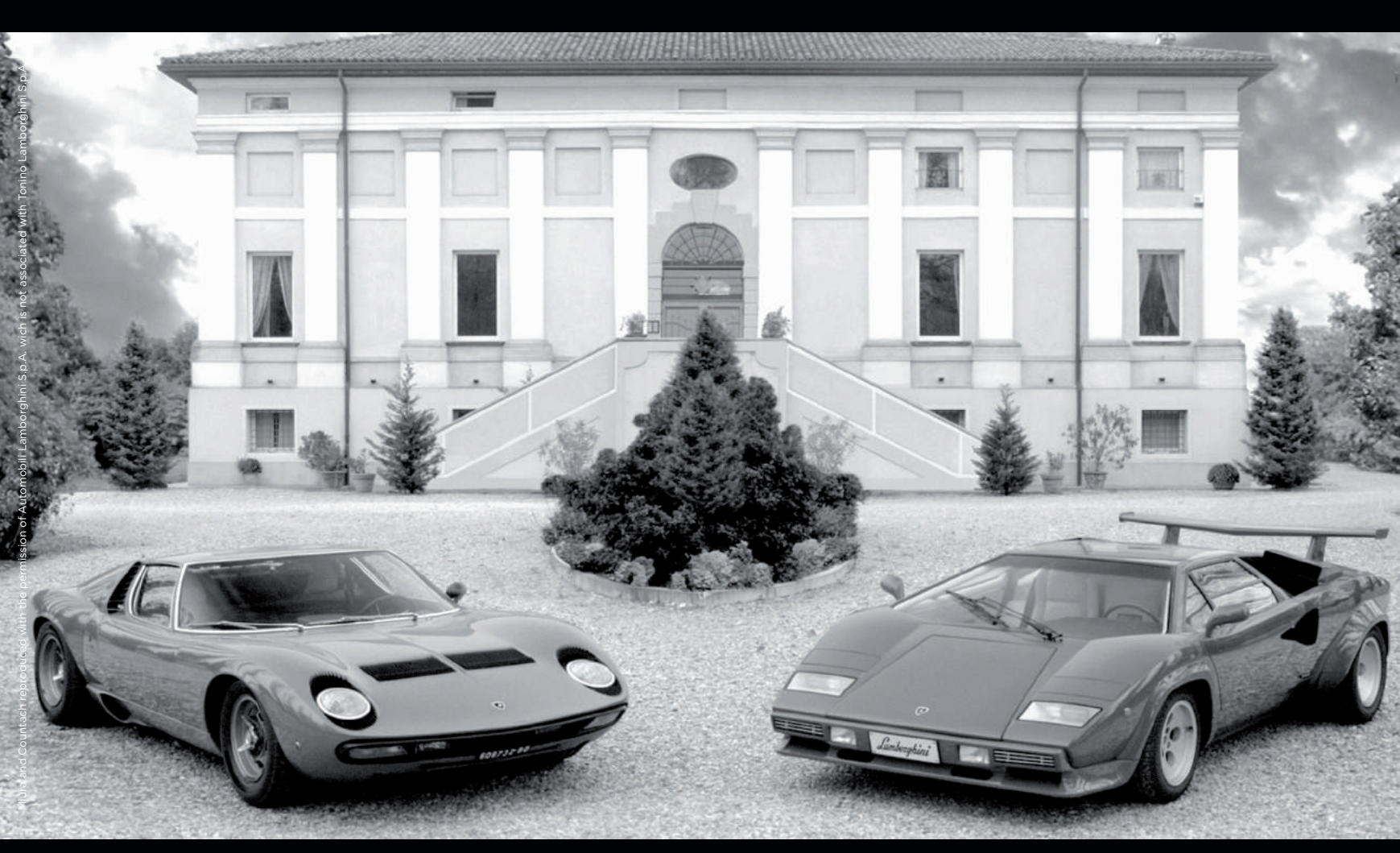
Palazzo del Vignola, Funo di Argelato (BO) Tonino Lamborghini Company Headquarters